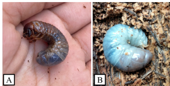
Figure 4. Oryctes rhinoceros larvae in the field. A: sick larvae and B: healthy/normal larvae

There were 34 larvae of O. rhinoceros found in the field, and one of them looked sick (Figure 4). The cause of the sick larvae was unknown, but the larvae were dead when found. In the three locations observed, O. rhinoceros beetle larvae were only found in the gardens of Riak Siabun Village, Sukaraja. In the other two locations, no O. rhinoceros beetle larvae were found, this was thought to be because the plants were still young, and these locations had just planted oil palm.