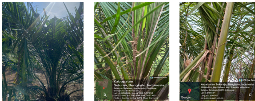
Figure 2. Symptoms of attacks in the field, a. V symptoms on opened leaves, b. Symptoms of attack on newly opened leaves, and c. The front was broken due to an attack by the beetle O. rhinoceros

Symptoms of O. rhinoceros beetle attacks can be easily seen on completely open leaves. The affected leaves were cut into V shape (Figure 2a), the newly opened (young) leaves will appear difficult to develop, and parts of the leaves begin to form V pattern due to the attack (Figure 2b). In heavy attacks, the grinding of the O. rhinoceros beetle can cause the fronds to break when they are completely open (Figure 2c).